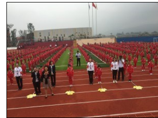
Morning exercise in Chongqing China's answer to our 'Daily Mile' (on a slightly larger scale)!